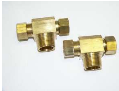
(Custom brass 1/2"compression x 3/4" MIP x 1/2"compression Pre-Fab T's)